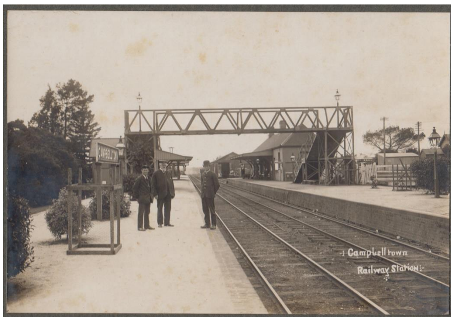
Campbelltown Railway Station