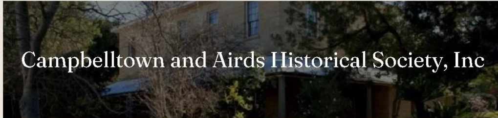
Banner of the new Campbelltown and Airds Historical Society, Inc. website.

The Campbelltown and Airds Historical Society, have recently changed website providers. This has resulted in an updated website, which you can now access at - https://www.cahs.org.au/ .