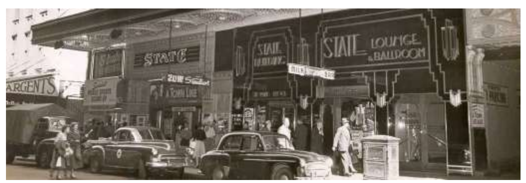
The Market Street entrance to the theatre in the early days

A group of Society members took a trip down memory lane on the 8 August. An early morning train took 17 members to St James station for the short walk to The State Theatre in Market Street. A stop for coffee and tea revived all for the excellent tour of the theatre conducted by a thoroughly knowledgeable guide. The guide's commentary not only informed but entertained as well. The theatre opened in June 1929 has undergone much in the intervening years, including near demolition. Thanks to far seeing people who cared, this important part of our heritage is now protected and provides a venue for live entertainment in unique surrounding.