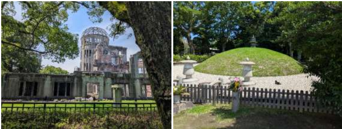
Left: The Atomic Dome

At 8.15 am, on the 6 th of August 1945, the US bomber Enola Gay dropped a single bomb onto the city below, Hiroshima. 44 seconds after release, the bomb detonated. A bright flash blinded witnesses for miles in all directions, followed by an intense heat and shock wave. Within the blink of an eye, most of the city was gone. In contrast to popular belief, those in the blast radius were not immediately vapourised but burnt and torn apart in an unimaginable display of destruction. Afterwards, few buildings remained. One amazing example was the Industrial Exhibition Hall (now the Atomic Dome), directly under the bombs detonation it survived the destruction.